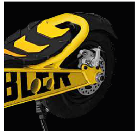
Tubeless tires 110/50-6.5"