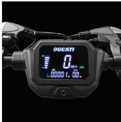
Wide display LCD 3.5"