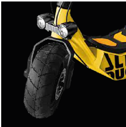
Double front LED light